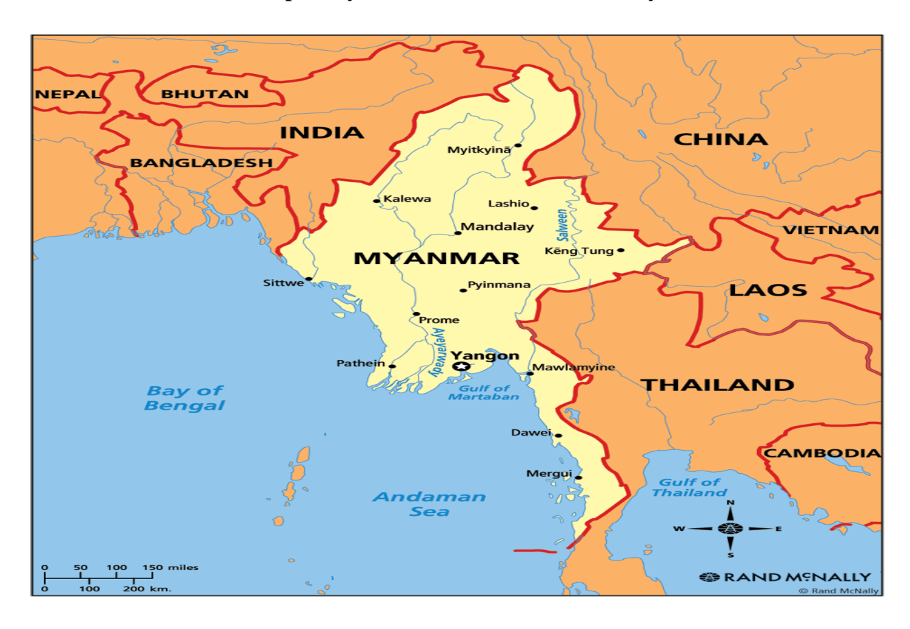
Map of Myanmar: Border Countries of Myanmar

has declined (Ganesan and Hlaing, 2007: 3). Myanmar has faced two challenges: a lack of democratic accountability and clashes in favour of minority rights. Myanmar has been included in the UN Least Developed Country List only for these problems since 1987. According to the UNDP Human Development Index, Myanmar is ranked 148 out of 187 countries (UNDP, 2016:9).